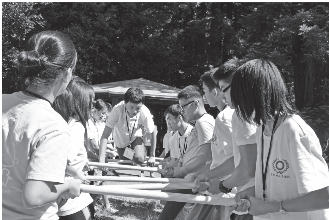
▲ 孝道體驗活動「I got you!」，使我們理解信任的重要。